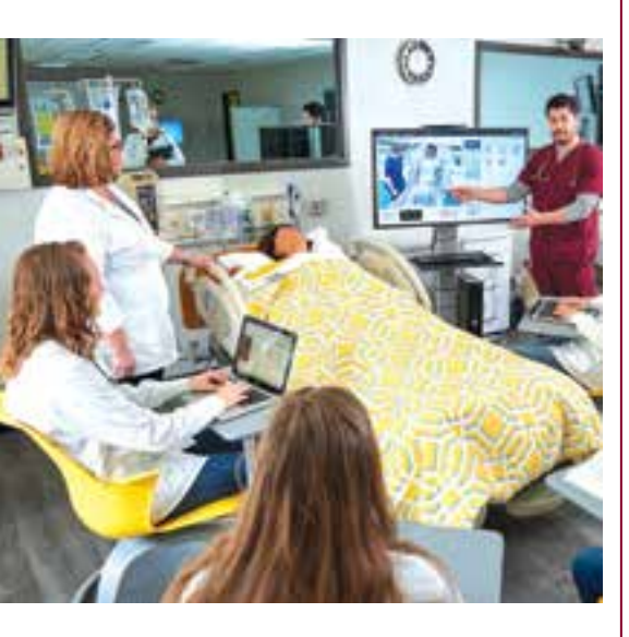
TOP TO BOTTOM: New Major In Sports Management Four-Year Graduation Guarantee Announced Byers School of Nursing Awarded Two Grants