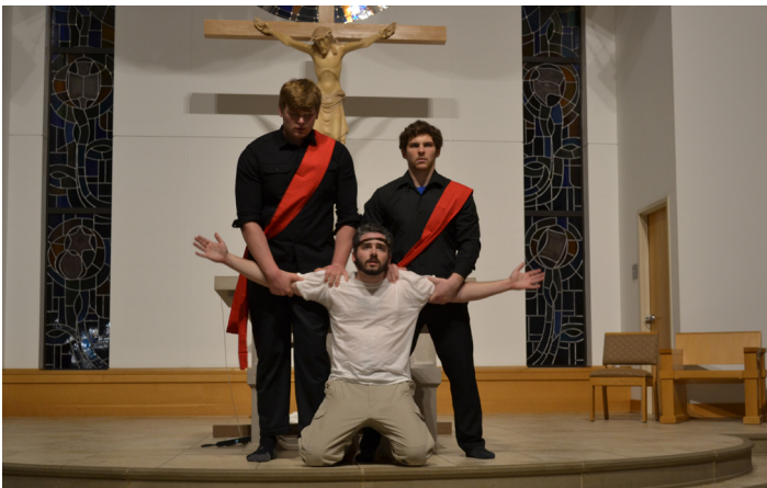
The annual production of Living Stations began in 2017 and has always been completely student-led.