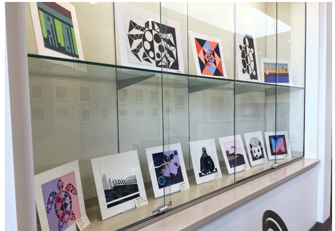
To see the full display of art, it will be available to view in the Birk Center for the Arts until May 1st.

This exhibit is the 11th student art exhibit to take place at Walsh and follows last year's 10th showcase, Art from the Heart. With over a decade of exhibitions, art has become an important part of Walsh's offerings which you can see for yourself.