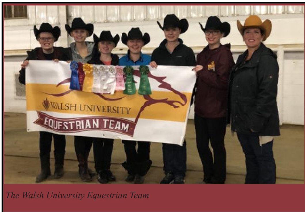
The Walsh University Equestrian Team

Walsh's Equestrian Team! My only regret is that I did not start sooner. It is such a blessing that I am able to take my passion for riding to college with me. Being on the team has made me a stronger rider, and I have